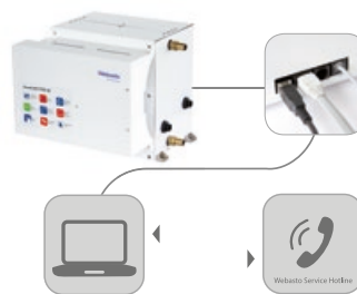
BlueCool Export Tool

BlueCool Export Tool suitable for all BlueCool AC units: