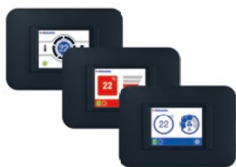
BlueCool MyTouch Display

The BlueCool MyTouch display is the new standard display for all BlueCool A/C Series: